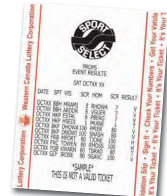
Sample PROPS Event Results