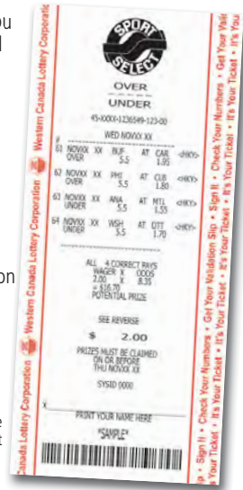
Sample OVER/UNDER ticket

IMPORTANT: For OVER/UNDER, final Hockey results are at the end of regulation play; final Soccer results are at the end of regulation play including injury time. Both sports do not include overtime or shootouts.