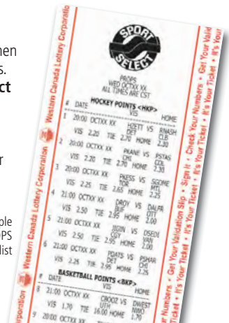
Sample PROPS event list