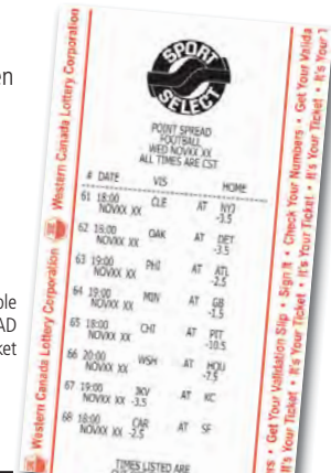
Sample POINT SPREAD ticket

For all sports except Hockey, final POINT SPREAD results include all extra play. For Hockey, final POINT SPREAD results end at regulation play.