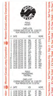
Sample POOLS card

HOW DO TIES WORK ON POOLS? Final outcomes for POOLS include all extra play (i.e. overtime, shootouts, extra innings, etc). If a tie occurs in a game, both outcomes are considered correct.